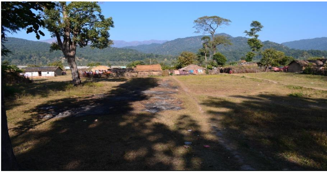
Fig2- Sunderkhal village between Corbett and Ramnagar Forest Division along with Kosi River